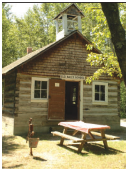
Bailey School House