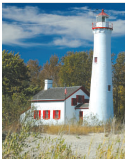
Sturgeon Point Lighthouse