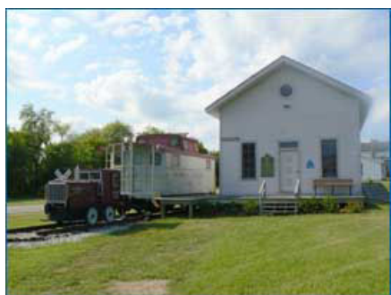
Lincoln Train Depot