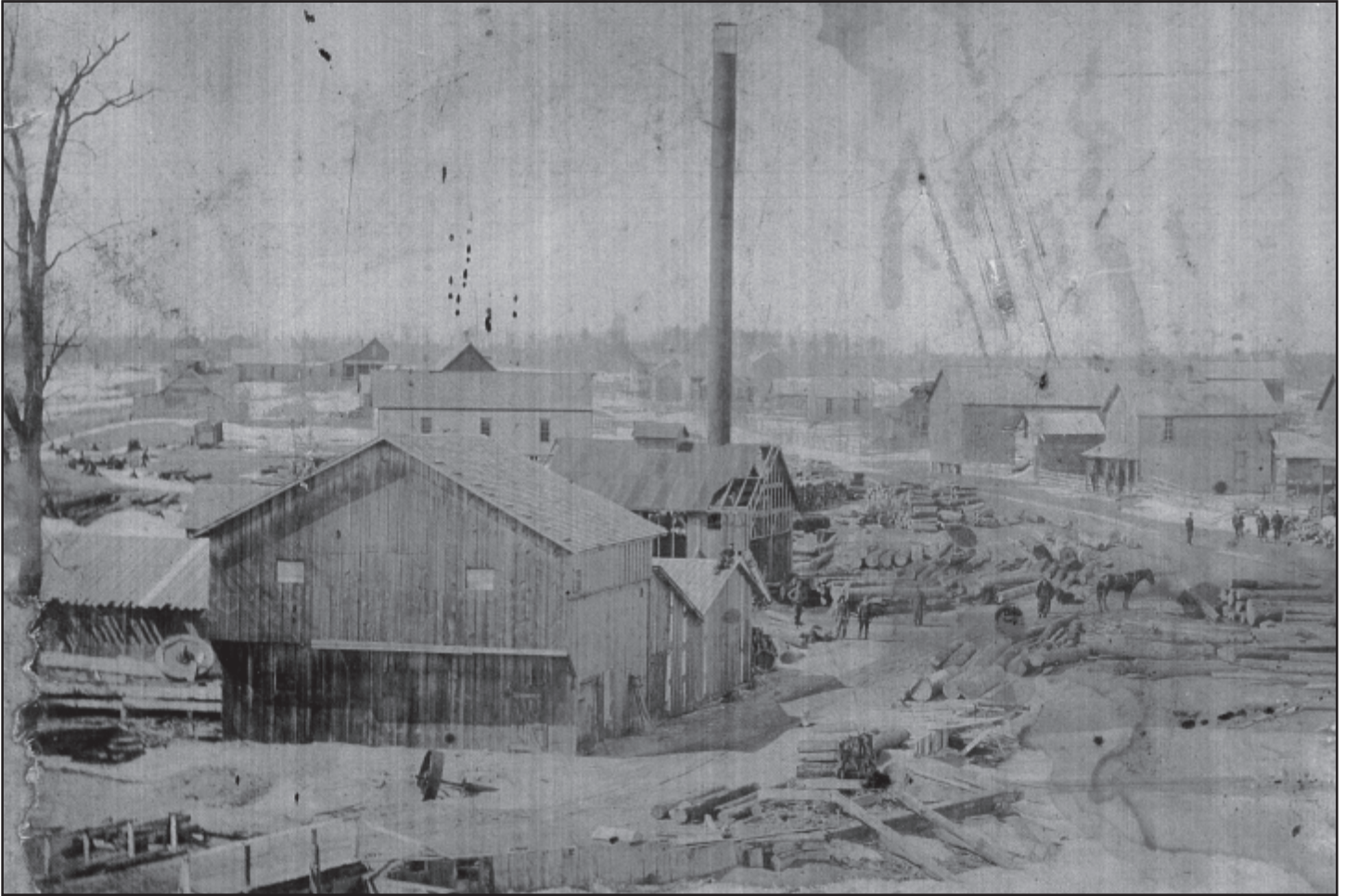
Village of Killmaster

The destruction of the bridge makes crossing Pine River at this point with teams impossible, though the township authorities will undoubtedly begin work immediately on a new one.